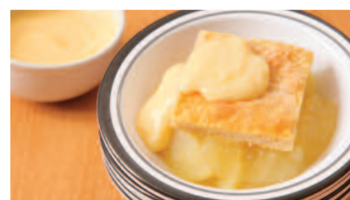
Apple Pie & Custard