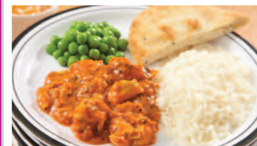
Chicken Tikka Masala served with Rice, Naan Bread & Seasonal Vegetables