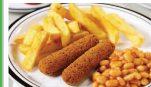
Breaded Mozzarella Sticks served with Chips & Peas or Baked Beans

VEGETARIAN VERSION OF THE ABOVE AVAILABLE DAILY