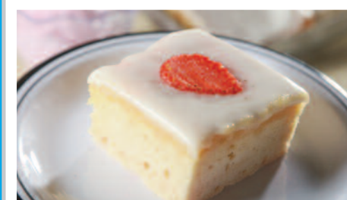
Strawberry Ice Cream Cake