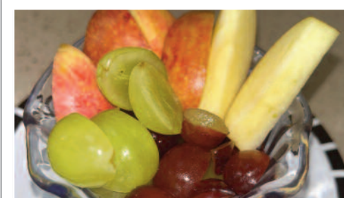
Apple & Grape Pot