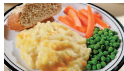
Mac 'n' Cheese served with Garlic & Herb Bread and Seasonal Vegetables