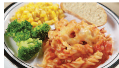
Cheese & Tomato Pasta served with Garlic & Herb Bread and Seasonal Vegetables