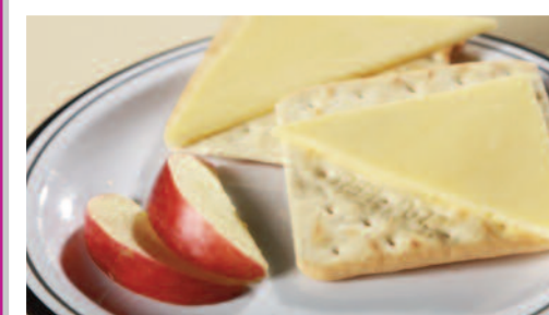
Cheese & Crackers