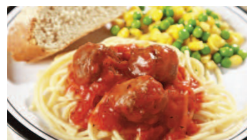
Meatballs in Tomato Sauce served with Spaghetti, Garlic & Herb Bread and Seasonal Vegetables