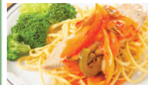
Sweet Chilli Chicken served with Noodles & Seasonal Vegetables