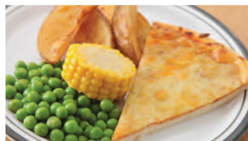
Cheese & Tomato Pizza, served with Potato Wedges & Seasonal Vegetables