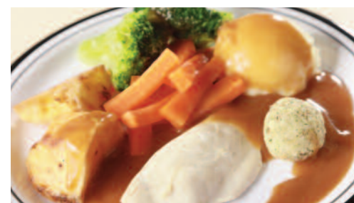
Roast Chicken served with Roast/Mashed Potatoes, Seasonal Vegetables & Gravy