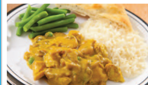
Chinese Chicken Curry served with Rice, Naan Bread & Seasonal Vegetables