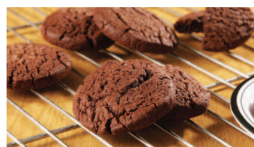
Chocolate & Orange Biscuit